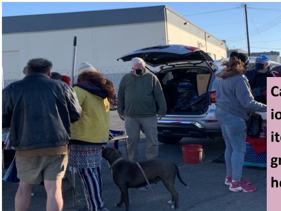
California Companions repurposing items for immigrants and the homeless.