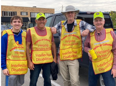
SPRED Collectors and Teachers