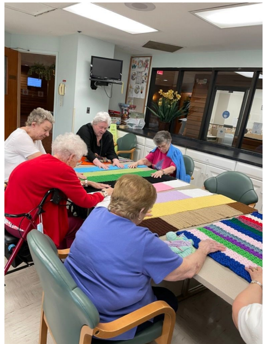
Prayer Shawl ministry, Northlake