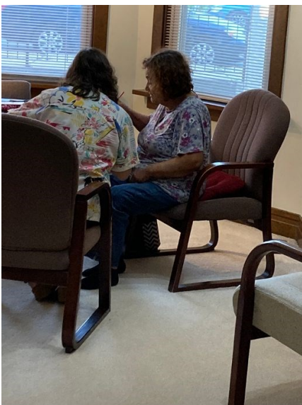
Mary Ward Center tutoring