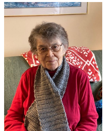
One of many knitters—scarves and hats for Mary Ward Center and Hesed House.