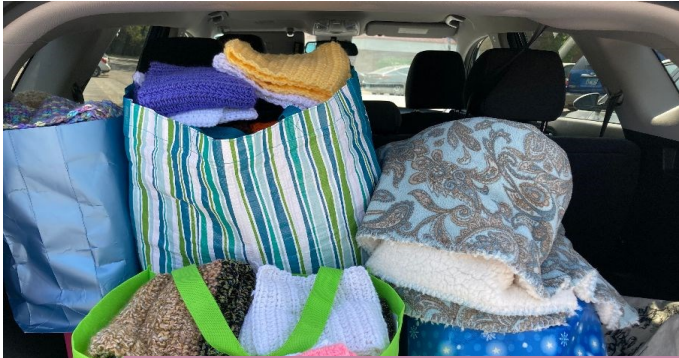
Silver and gold have I none, but what I have I give to you