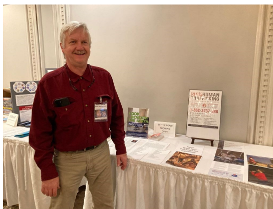
Presentation table, one of many events