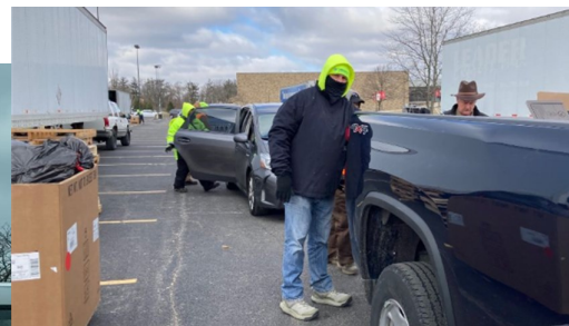
Community Sustainability Day in DuPage County