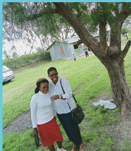
Ministering and sharing the Love of Christ with the youth