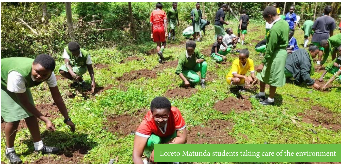
Loreto Matunda students taking care of the environment

In the words of this beautiful canticle, Saint Francis of Assisi reminds us that our common home is like a sister with whom we share our life and a beautiful mother who opens her arms to embrace us. Some forms of pollution can be part of my experience. The Exposure to atmospheric pollutants produces a lot of harm to people and they get sick, for example, from breathing high levels of smoke from fuels used in cooking or heating. There is also pollution that affects everyone, caused by transport, industrial fumes, substances which contribute to the acidification of soil and water, fertilizers. Therefore through this message we were encouraged to give our care for our common home. This also has challenged us to plant trees around our school com-