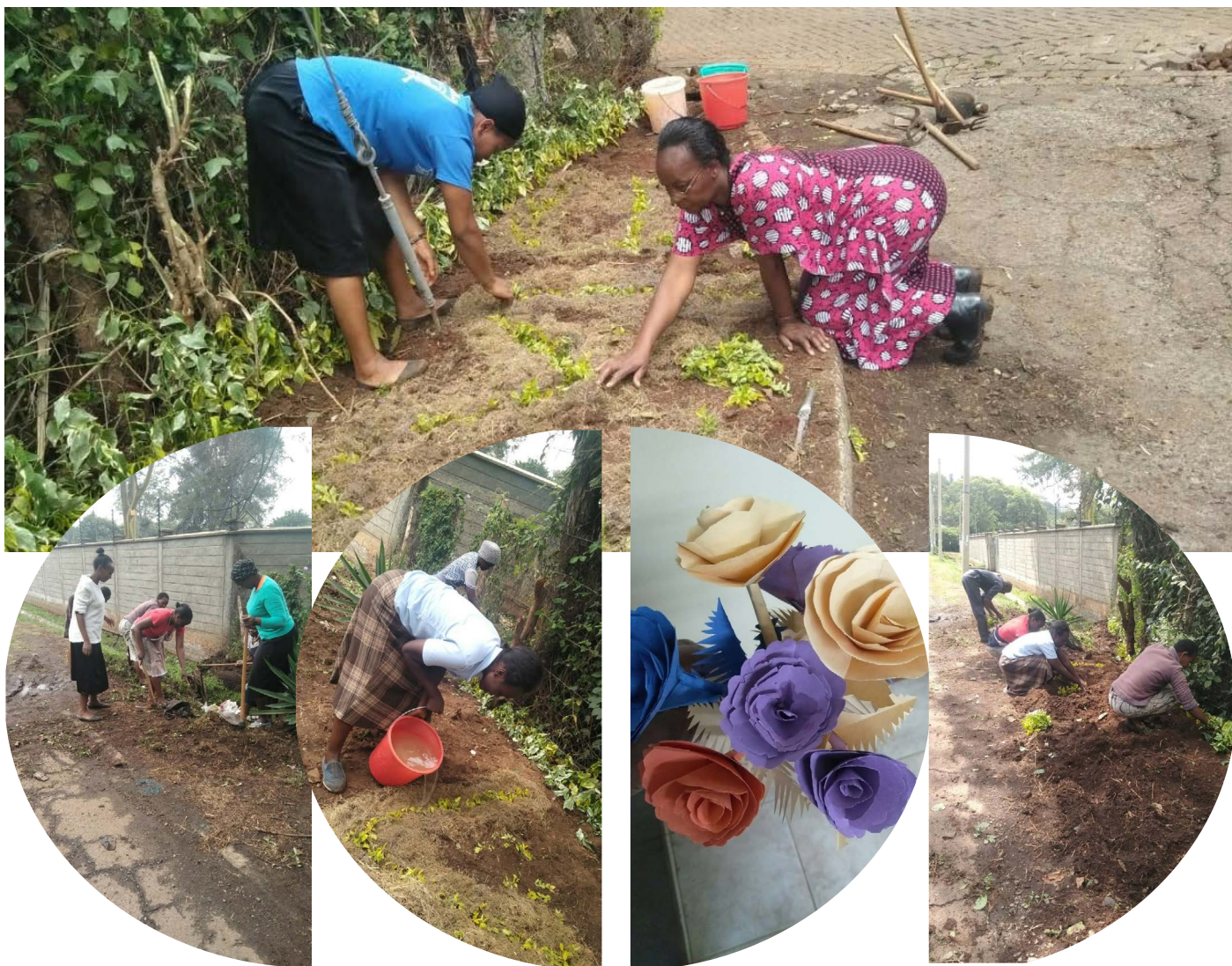
Some of the Laudato Si activities in the novitiate community