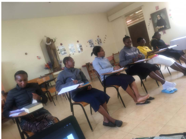
Novices attending a workshop on Active Nonviolence and Peace building

M y lived experience of the Laudato Si Living the Laudato Si has made me to relate and interact with the environment and all that surrounds it. By this, I have engaged in different activities such as training and creating awareness especially to our girls in the school. This is through the Environment and charity events that we hold in our school. We have also empowered the Environmental/JPIC Club in the school.