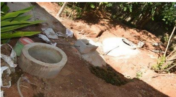
BIOGAS is affordable, clean and environmental friendly

I have experienced the care of the environment as something we have been doing as Loreto Sisters despite the name Laudato Si. This is a call to all to take responsibility for our environment and humanity. As a community, we use biogas as a substitute to reduce the cost of cooking gas.